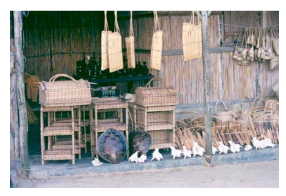
Figure 6. Green turtle carapaces (Chelonia mydas) for sale in the local market, Bilene beach.

The growth of costal tourism in the country (Abrantes & Pereira, 2003), could stimulate the development of this activity, which could be undertaken by both tourism operators as well as by the local communities. However, being a highly seasonal activity it would not support a large industry. It could be an extra service offered by settled tourism operators or an alternative for the local communities. Either way, these operations will require specific regulations to be sustainable.