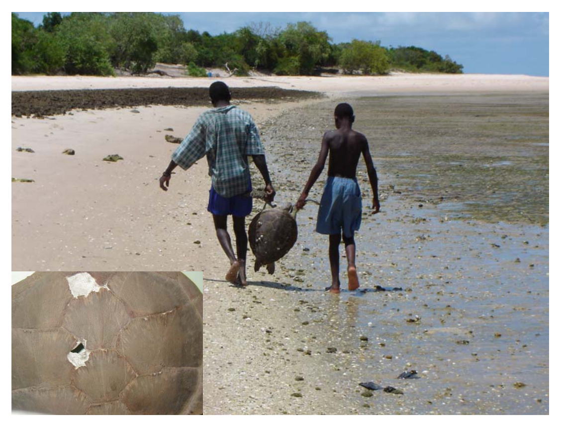
Figure 4. Green turtle captured in BANP. Inset: carapace of a green turtle captured by spear gun at Tofo beach, Inhambane.

Currently, the practice of capturing marine turtles for feeding and posterior sale of its carapace is becoming a common practice in the coastal zone of the country, with turtles being "accidentally" caught in trawling or gill nets, caught on the beach during nesting or using spear guns (Figure 4).