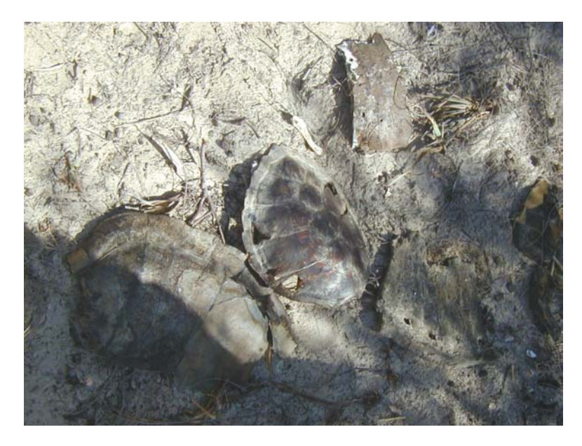
Figure 5. Remainings of the carapace of marine turtles captured, grilled and consumed in the coastal dunes in Praia do Tofo.

Due to the lack of information from remote areas, it is difficult to predict in which areas marine turtle mortality is highest. As mentioned before turtle mortality is widespread throughout almost the entire coastline. Nevertheless, the Sofala Bank (Gove et al. , 2001), Vilankulos - Inhassoro (Gove & Magane, 1996), and Barra-Tofo-Tofinho and Bilene (Pereira, M.A.M., pers. obs.; Figure 5) deserve especial attention. Up in the northern part of the country, although there is a great occurrence of marine turtles (Hughes, 1971), information is still scarce. Therefore, one should consider that mortality should also be high in areas with the greatest concentration and nesting of marine turtles, as reported by Hughes (1971).