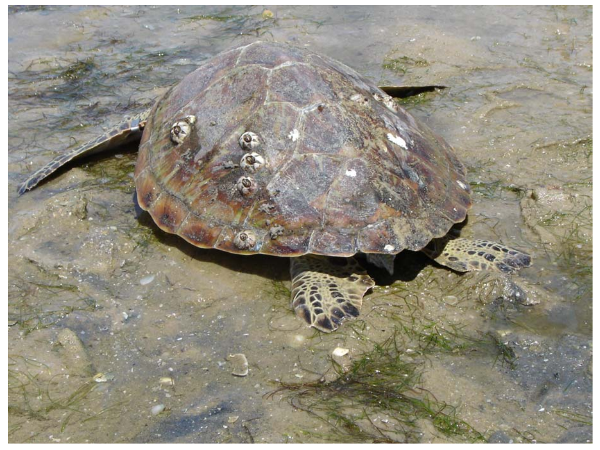
A tagged green turtle is released at BANP

This report presents published information that was available to the authors. Several individuals have been consulted, especially tourism operators from remote locations in the coast that have provided data regarding occurrence and threats to marine turtles. Therefore, this document should be revised and updated periodically.