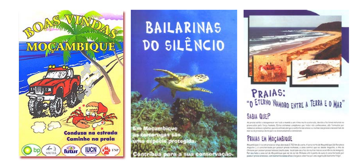
Figure 8. Posters and brochures used during the 2000/2001 Welcome Campaign.

Coordinated by FNP, in collaboration with MICOA, FUTUR, the Navy, Migration Authorithies, Police and Local Administrations. This campaign focused on coastal tourism in southern Mozambique (Maputo, Gaza e Inhambane) and involved education and awareness to the conservation of coastal and marine environment, mainly sandy beaches, coral reefs and marine turtles (Figure 8). This carried out by the distribution of brochures, posters and stickers at the borders, hotels, camping sites, restaurants, etc. (Abrantes & Pereira, 2002).