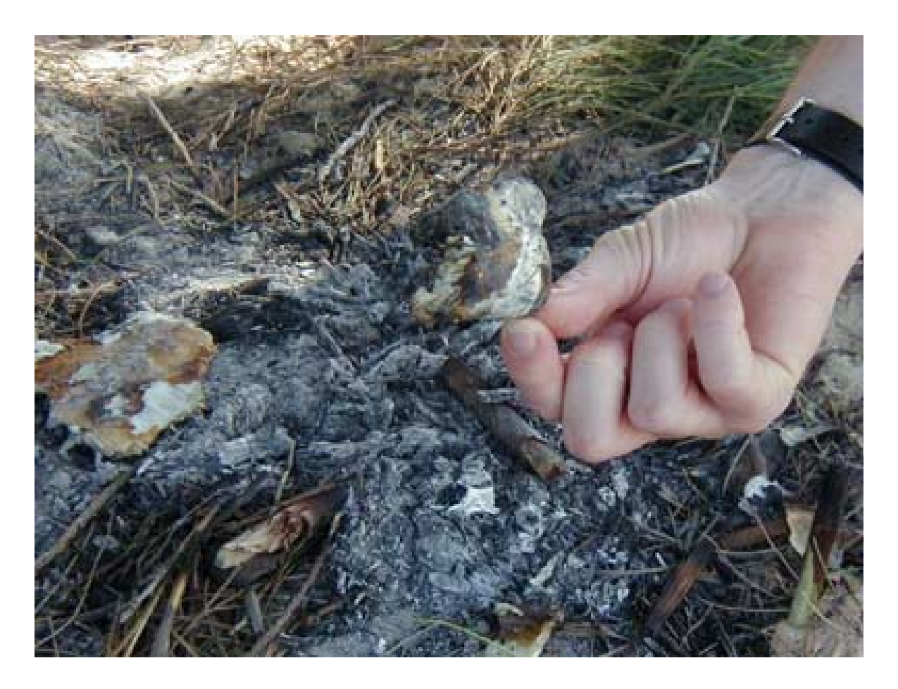
Figure 7. Marine turtle meat is commonly consumed by coastal populations. The photo shows a fire where a turtle was consumed, moments before, by fishermen at Tofo beach, Inhambane.