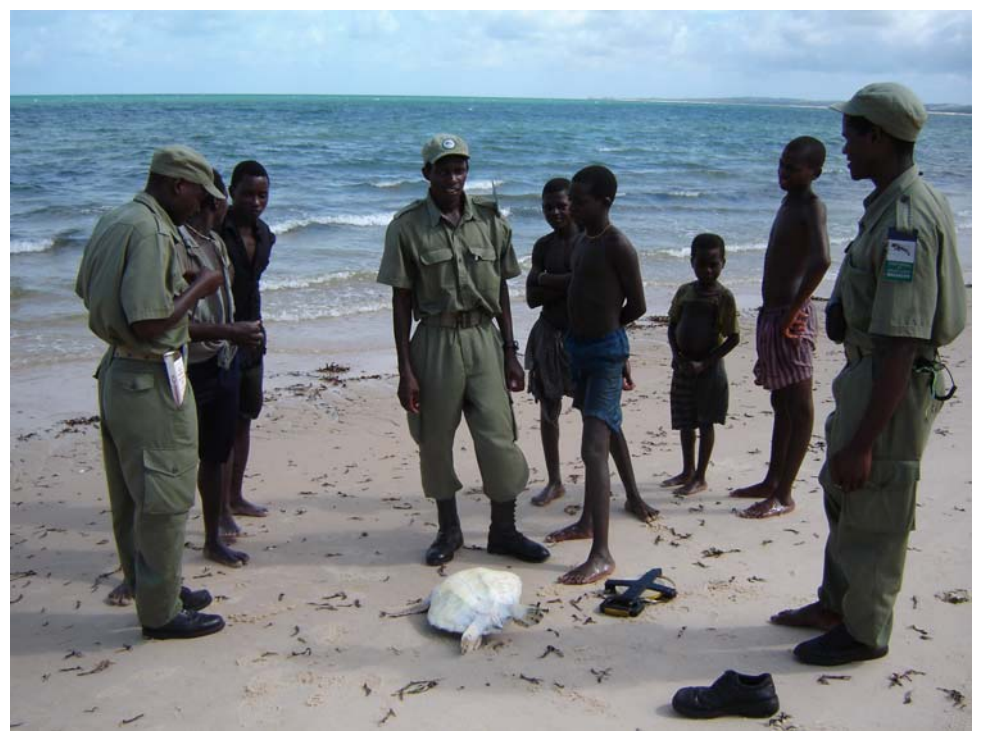
Education and enforcement activity by BANP guards